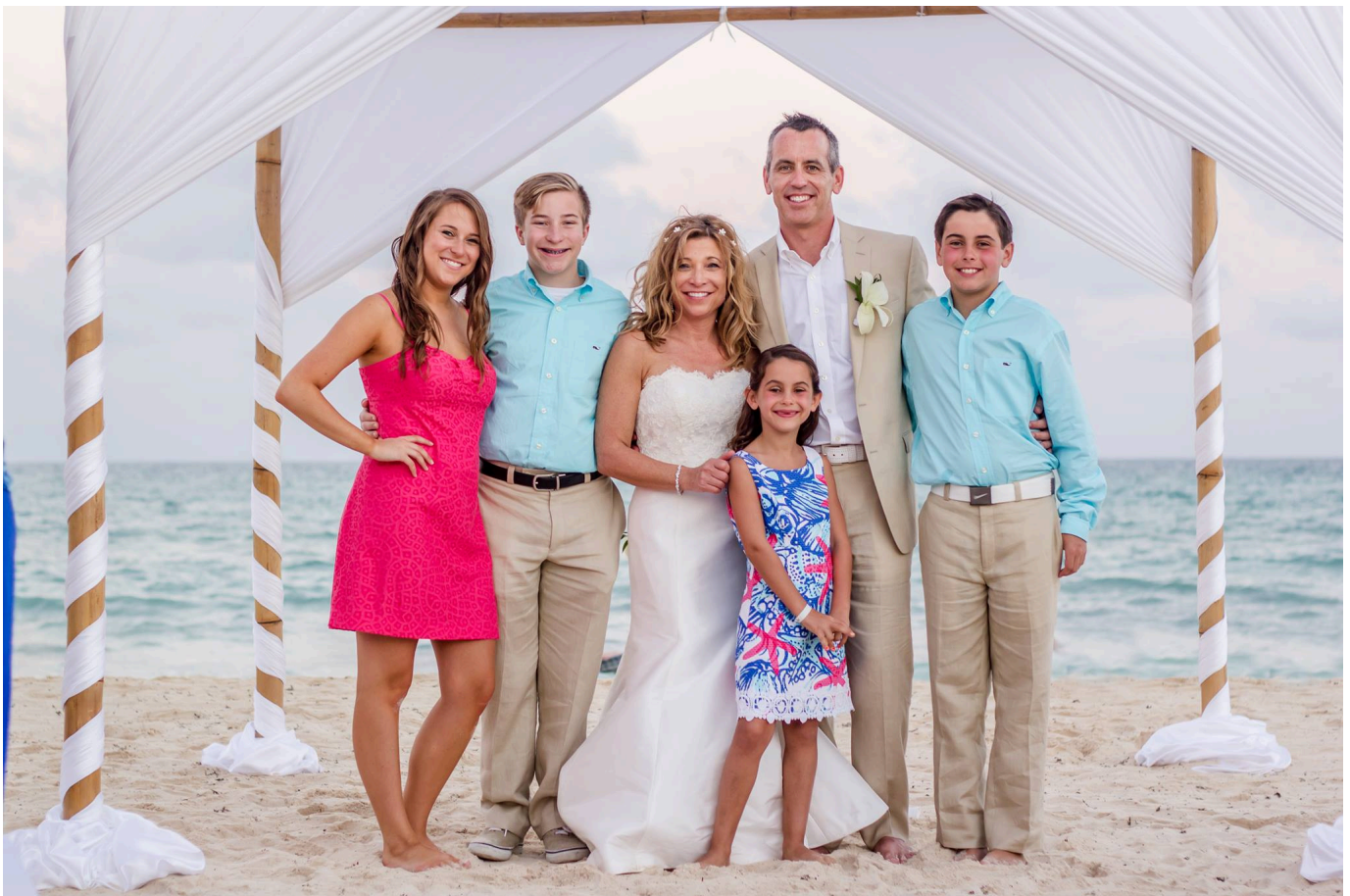
My wedding - November 2014, Playa Del Carmen, Mexico

I went on to buy six houses in July and August of that year. In October, I quit my full-time job and started Express Homebuyers. Today we have bought over 2,100 houses. Express Homebuyers operates as a 7th level business – meaning it runs without my involvement. This affords me the ability to live life on my terms. I travel 10+ times a year, wake my kids up, get them breakfast and off to school. I'm home every night for dinner and I never miss one of their events.